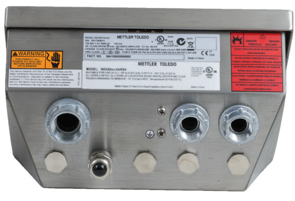
[UL model shown]