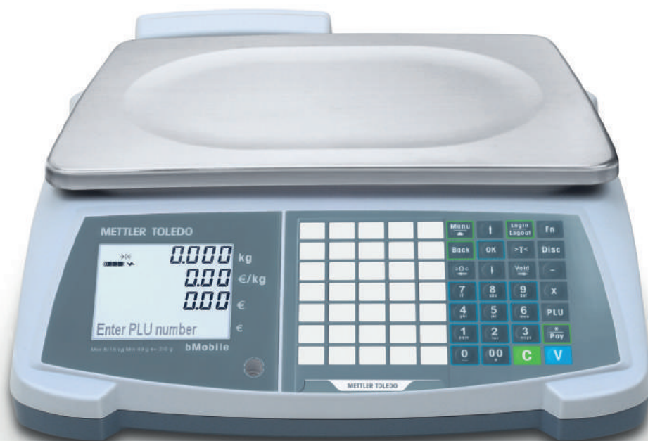
bMobile Compact Scale

With quick and accurate weighing and service, bMobile from METTLER TOLEDO is an economic price computing scale with a receipt printer that is designed to make your life simpler. It is a functional scale based on years of experience in leading scale technology.