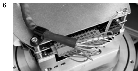
Insert cable into lid and attach connectors.