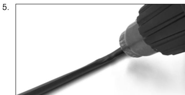
Shrink tube with hot air fan (approx. 10s at 400 °C {752 °F}).