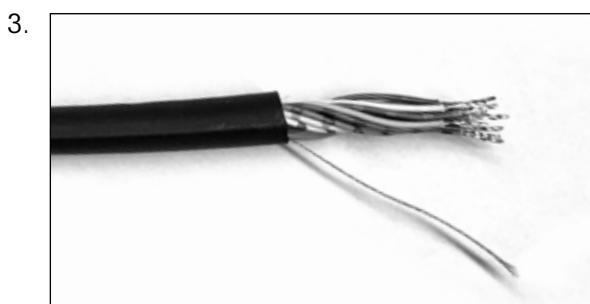
Insert ground braid into shrinking tube.