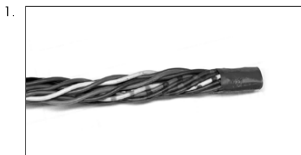
Twist cable and fix end with tape.