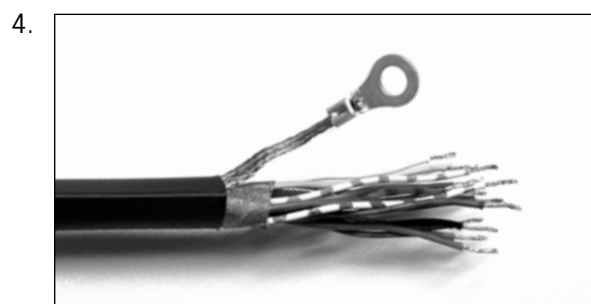
Connect ring terminal to ground braid.