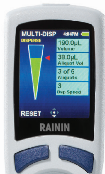
E4 XLS+ in Multi-Dispense Mode