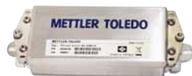
Base option: AJB641S junction box