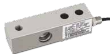
Base option: SLB215 load cell