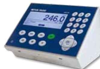
Base option: IND246 terminal