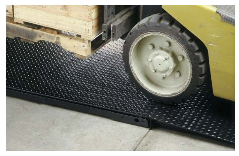
The scales are designed for 100% end loading to handle forklift traffic.