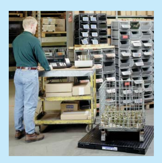
VERTEX scales are ideal for high-precision, heavy-capacity counting applications.