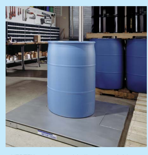
VERTEX scales provide the dependable repeatability needed for batching and filling.

VERTEX scales are NTEP certified for 5,000-division accuracy. For applications that require a higher level of performance, we offer versions of these scales with 10,000-division accuracy. We can provide a factory test loading report verifying 5,000-division accuracy or 10,000-division accuracy (not legal for trade).