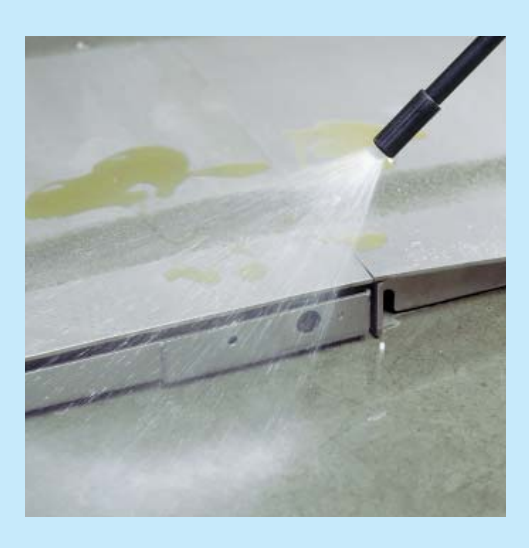
Choose from 304 or 316 stainless steel for sanitary applications.