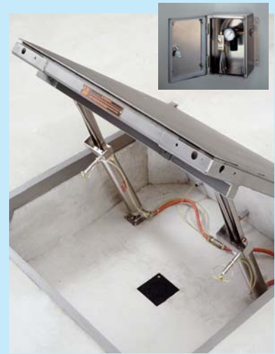
Pneumatic control and cylinders automatically lift the EZ-CLEAN scale for cleaning.

The EZ-LIFT scale has gas-pressurized struts that make it easy to lift the platform for cleaning.