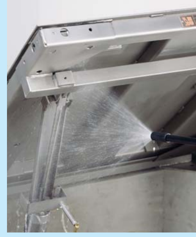
The EZ-CLEAN scale tilts up 45 degrees to expose the underside and pit for washdown.

of suspension system is more reliable and durable than threaded connections.