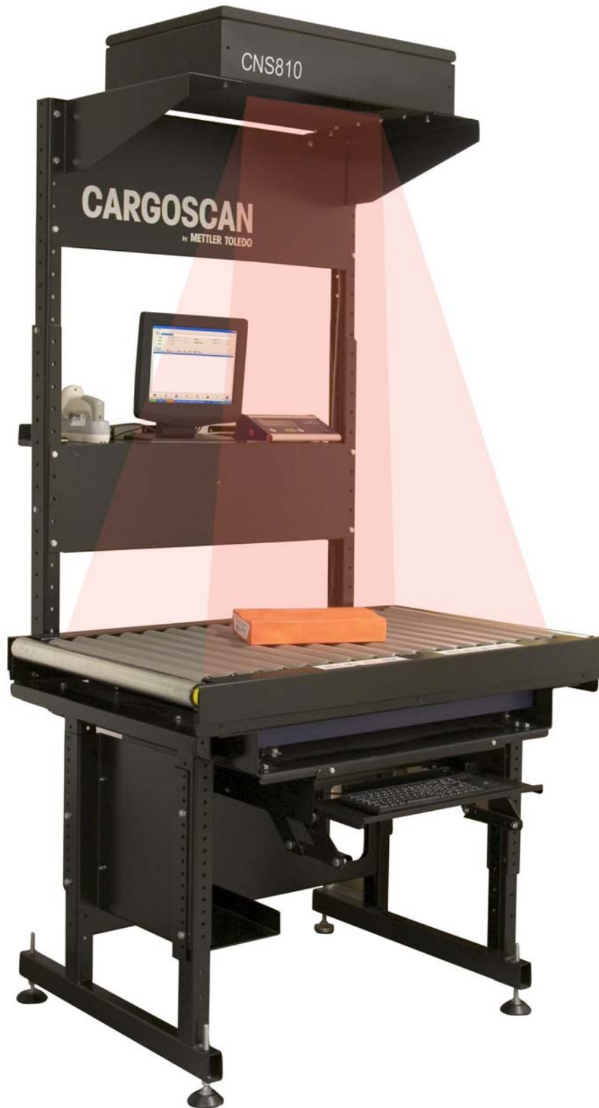
METTLER TOLEDO Model CSN810 Dimensional Measuring Instrument