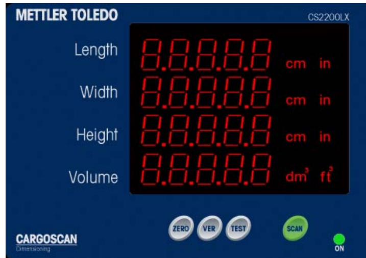
(a) Typical Display of a METTLER TOLEDO Model CS2200LX Indicator