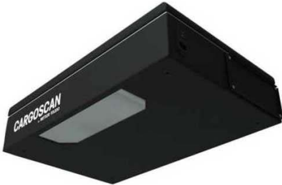
(a) METTLER TOLEDO Model CSN810 Laser Scanner