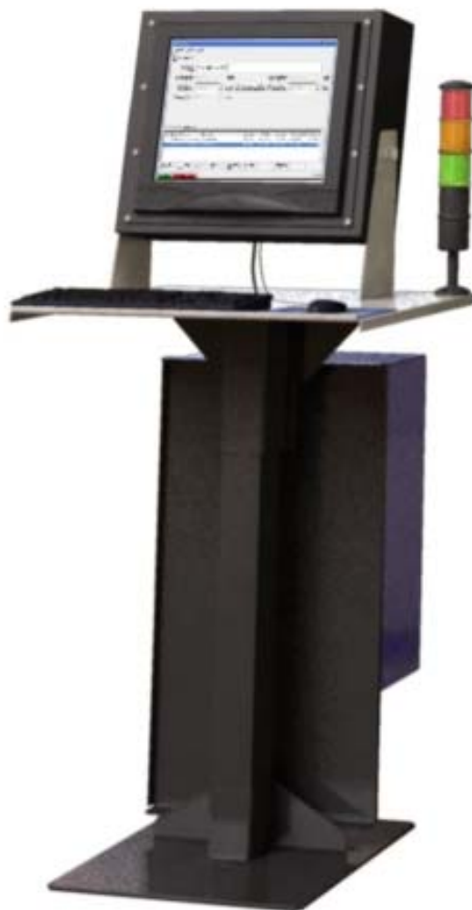
(b) Typical Optional Workstation