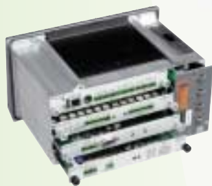
The JAGXTREME terminal is configurable to provide high functionality at an economical value.