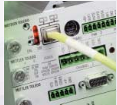
The JAGXTREME terminal's TraxEMT™ lowers the cost of ownership by embedding a virtual METTLER TOLEDO technician into every JAGXTREME terminal.

It is the first industrial weighing solution to integrate information, equipment life cycle management, and automation control into the manufacturing enterprise — and the only one that enables you to weigh fast, weigh powerful, and weigh cool.