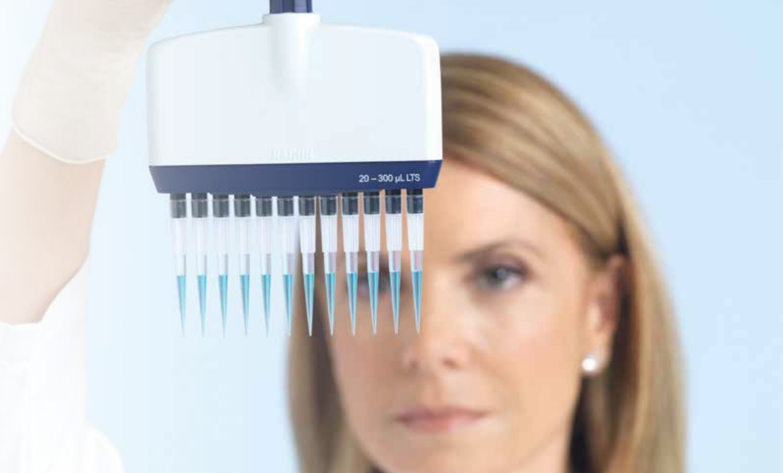
Pipet-Lite™ XLS Multichannel Pipette

From pipettes to tips to service, a comprehensive liquid handling solution.