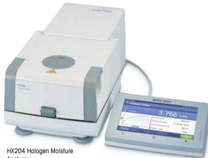
HX204 Halogen Moisture Analyzer

When moisture matters, Excellence Moisture Analyzers deliver outstanding value. The new generation of instruments provides highly reliable results in the fastest possible time. Boost productivity with a powerful combination of real-time graphics and convenient data management. Print A4 color reports on network printers. Ruggedness and ease-of-use ensure disruption free operations.