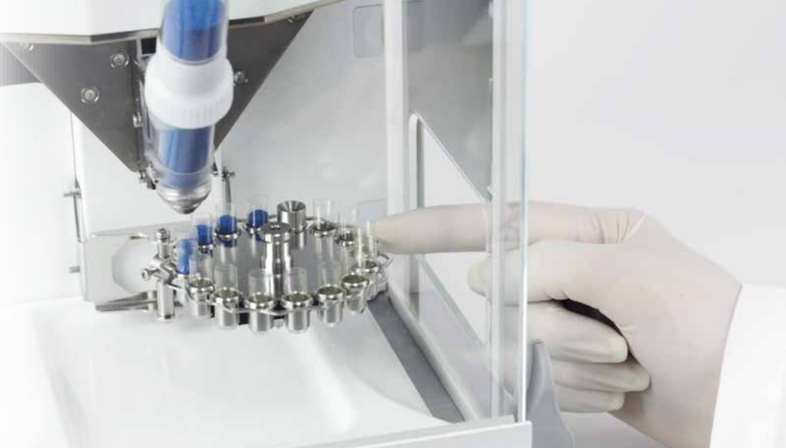
Quantos: Automatic gravimetric dosing