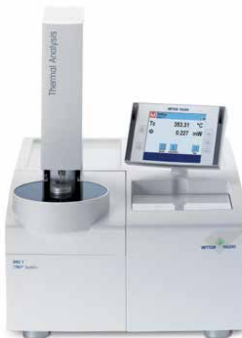
DSC 1 with sample robot