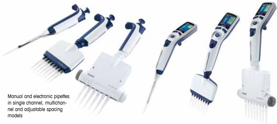
Manual and electronic pipettes in single channel, multichannel and adjustable spacing models

Industry-leading accuracy and precision: Rainin's family of XLS pipettes