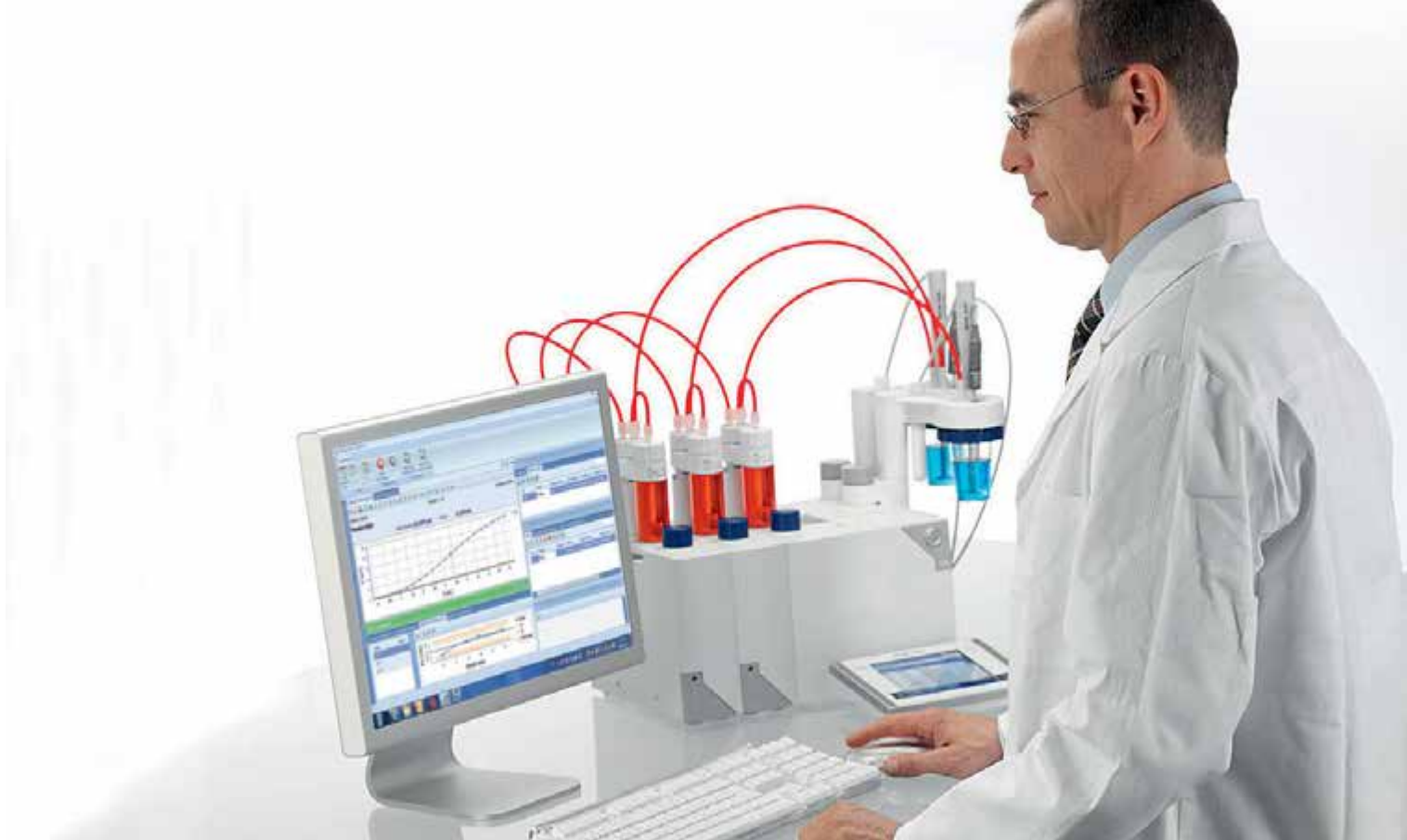
Excellence Titrator with LabX software