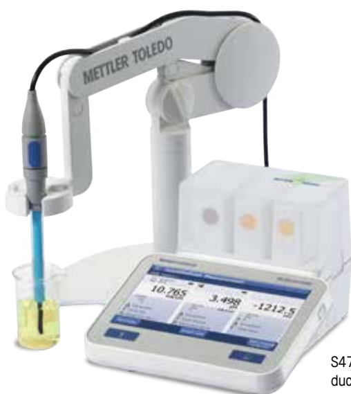
S470 SevenExcellence™ with conductivity, pH and ORP indication

SevenExcellence measures pH, ion concentration, conductivity, oxidation reduction potential (ORP), dissolved oxygen (DO) and biological oxygen demand (BOD). It redefines flexibility and stands for convenient operation combined with measurement accuracy and outstanding reliability.