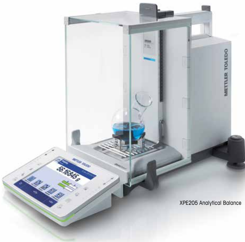
XPE205 Analytical Balance

Weighing the smallest amounts with optimum accuracy