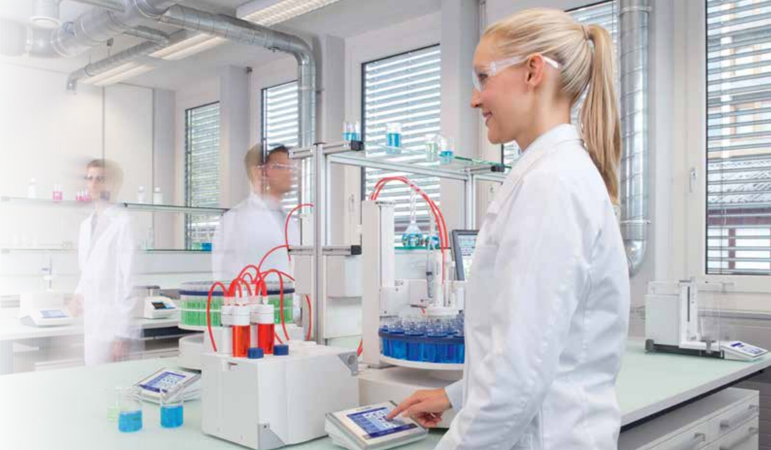
Automated analysis systems to master high workload