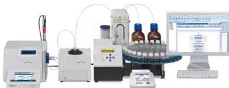
Density meter, refractometer, pH meter, sample changer and LabX software

High resolution instruments alone do not guarantee accurate measurements because the results can still be influenced by the operator or by sample-related effects. Automation is thus not only the best guarantee for a high sample throughput and fast payback, it also helps to prevent measurement errors.