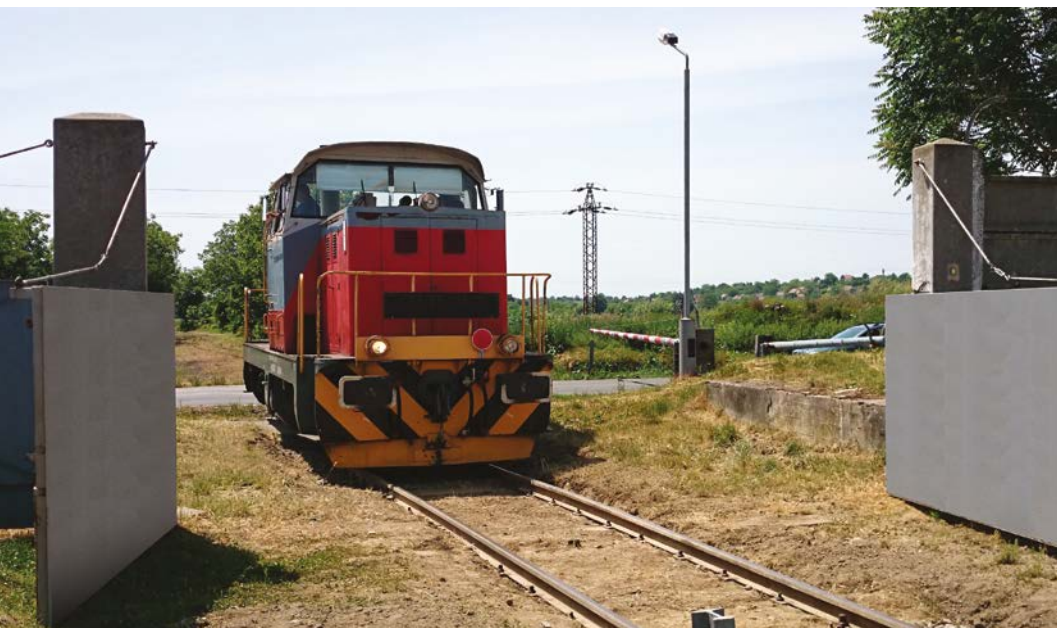
The coupled in-motion scale makes it possible to weigh trains without stopping them and blocking traffic on the highway outside the facility's entrance.

Downtime was a major concern. Pouring a concrete foundation would have prevented trains from entering the facility for a month while the concrete cured. A custom foundation design allowed the installers to minimize disruption to the