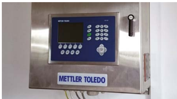
An IND9R86 controller manages the in-motion weighing process and stores weights for all railroad cars.