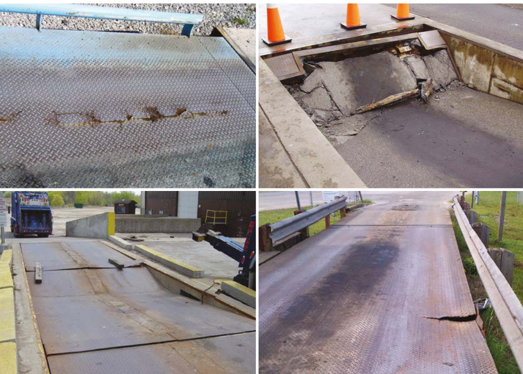
When you buy a scale that has not passed life-cycle testing, you risk having to pay to replace a weighbridge due to premature failure.

For each new design, an actual module undergoes accelerated-life-cycle testing on our "module masher" test stand. The first "module masher" was designed and built in 1992 by the engineering and manufacturing teams at our heavy-capacity manufacturing plant in the United States. No other manufacturer has anything like it.