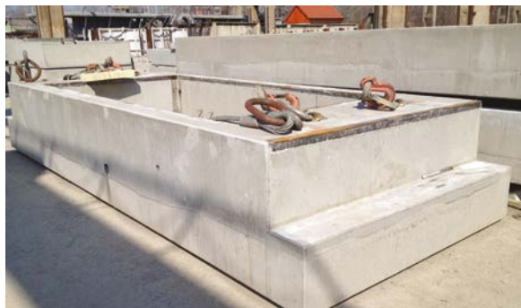
Providing a fully formed foundation eliminated the downtime associated with pouring concrete on site.