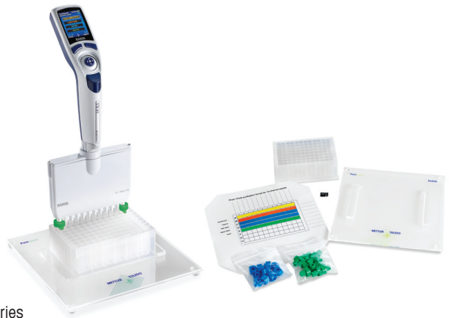
Figure 1: E4 XLS with Purespeed Tips and accessories

HPIP uses a Rainin E4 XLS electronic pipette and PureSpeed Protein tips containing either ProA or ProG resin to perform reproducible IP experiments. Other components of the system include a 96-deepwell plate, adapters, deepwell plate base and ColorTrak™ guide, shown in Figure 1.