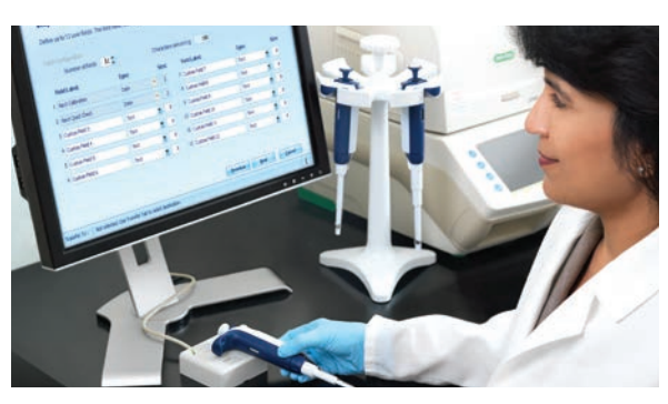
Optional RFID Reader works with all Rainin RFID-enabled pipettes, and interfaces with METTLER TOLEDO'S LabX<sup>™</sup> software for Pipette-Scan<sup>™</sup> calibration check.