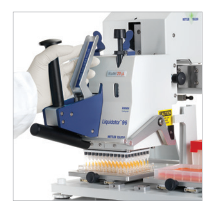
Start and stop assay reactions simultaneously

Rest assured that Liquidator consumables are completely inert and will never affect experimental outcome in any way. BioClean tips and reservoirs are guaranteed to be free of DNA, DNase, RNase, pyrogens and ATP.