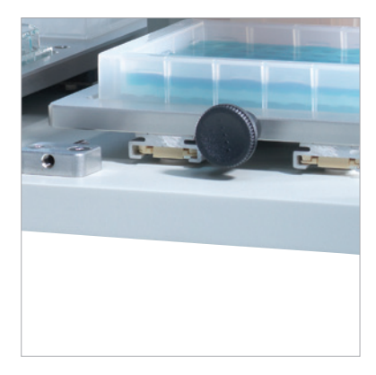
Get guaranteed purity with BioClean consumables