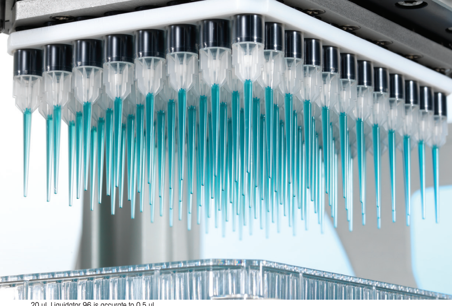
20 µL Liquidator 96 is accurate to 0.5 µL