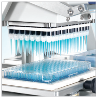
Eliminate the risk of skipping or repeating wells