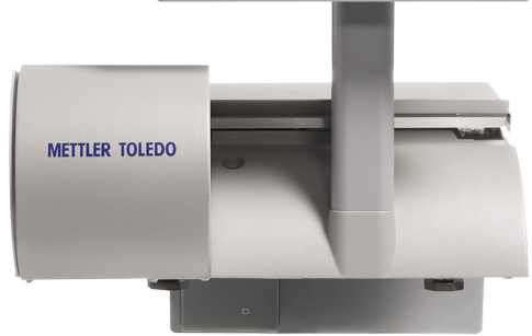
UC-CWT Evo Counter Scale