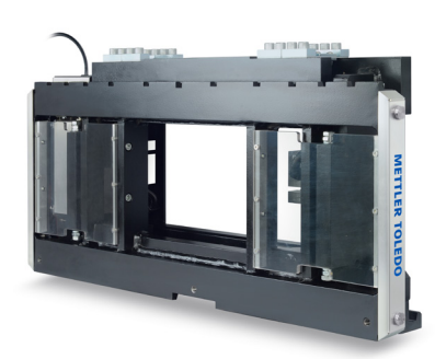
VFS120 Basic Connectivity

Choose the right scale for your operation based on your integration requirements