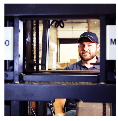
High operator visibility A large visibility window and plexiglass protection plates allows safe positioning, loading and transportation of goods, while maintaining optimal productivity.