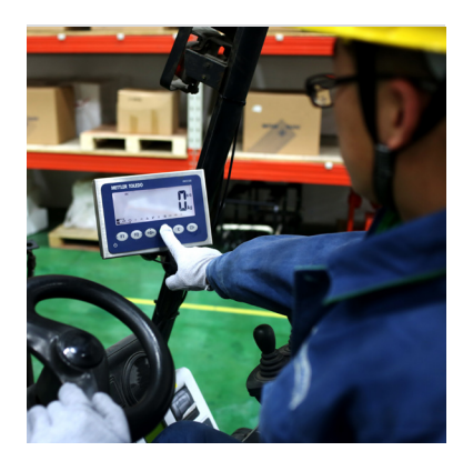
Keep operators off the floor With no need for the operator to get out of the truck to process paperwork or use a dimensioner, the risk of accidents is significantly reduced.

Safety is paramount in fast-paced freight-handling environments. Our forklift scales are designed with operator safety as a priority. Features that ensure operators are always in control help to avoid accidents and maintain productivity.