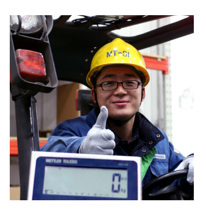
Safety test approved All precautions have been taken to ensure safe operation of our scales. We have undergone 1 million fatigue tests to prove mechanical safety and durability.