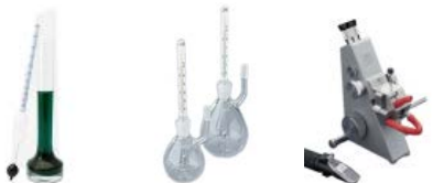
Brix Hydrometer, Pycnometer, Abbe Refractometer