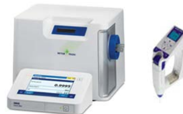
Digital Density Meters