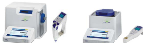
Digital Density Meters