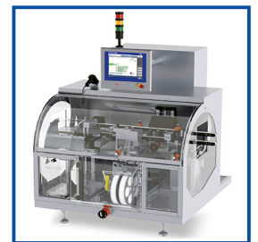
Track & Trace