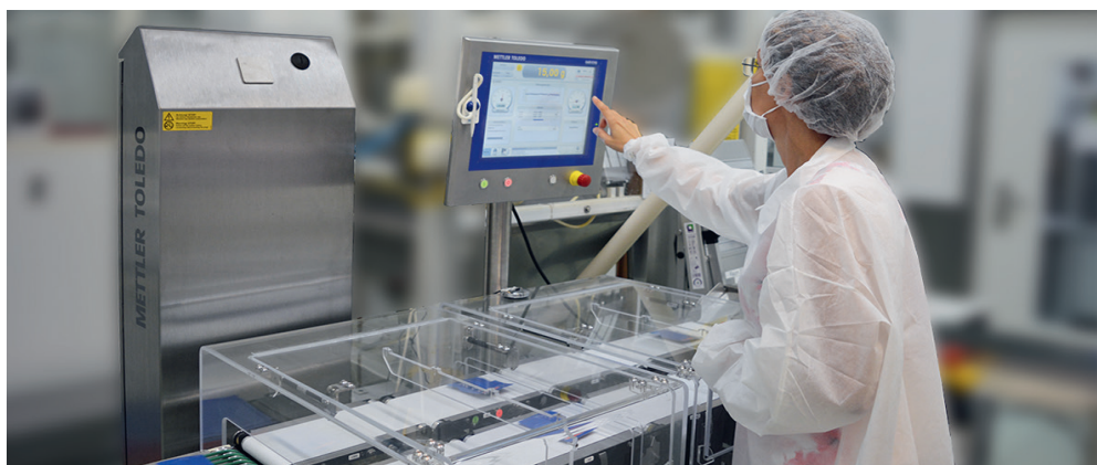
The two-lane checkweigher C35 AdvancedLine ensures both high throughput and high weighing accuracy.

Over 400 employees work for Orthomol at its three sites in Langenfeld and in field services. Annually over 50 million pouches and 12 million drink bottles leave the premises. For more than 18 years, Orthomol has been putting its trust in advanced dynamic weighing technology: checkweighing solutions from METTLER TOLEDO. Now a new two-lane C35 AdvancedLine checkweigher has commenced operation in the final packaging area. Sitting on a single frame, the dual lane superstructure of the checkweigher takes up minimal space and was easily integrated into the existing line.