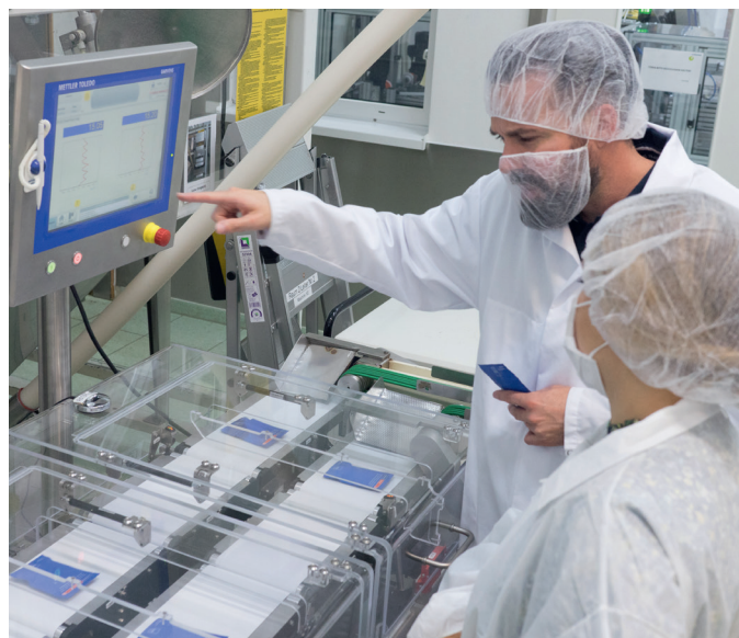
Changeover to another product is just as easy as calling up statistical information from one of the two checkweighing lanes.

To allow for asynchronous and independent operation of the two lanes, each lane can be individually controlled if need be. Moreover, if one lane breaks down, the second weighing lane will continue to work undisturbed.