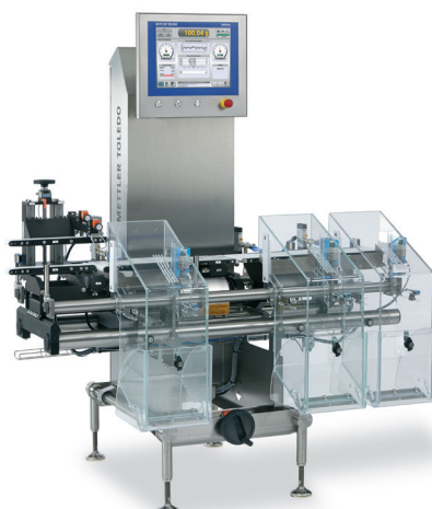
C35 Pharma checkweigher, a variant of C35 AdvancedLine