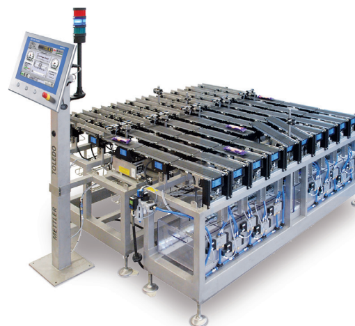
A multi-lane checkweigher (example with ten lanes)