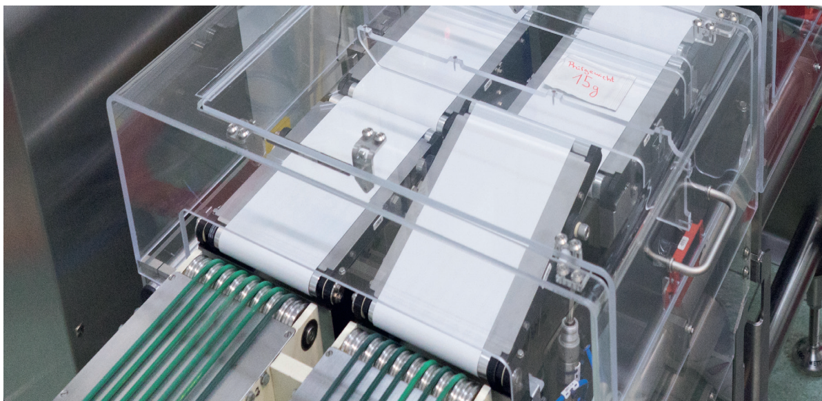
The lift gate conveyors of this C35 AdvancedLine open up against the transport direction to reject products; this is a very space saving and gentle solution which, in many cases, is more suitable for a dual lane or multi-lane checkweigher than air blasts (air jets) or pneumatic pushers. The sachet in this photo is a test sample.

Orthomol's sites in Langenfeld are home not just to the company's R&D, medicine and marketing departments, but also to quality assurance, which is a key focus within the company. From the moment of commissioning, the new two-lane checkweigher has provided stable, reliable weighing results, checking the filling process of "Orthomol Immun" – a dietary food product with immune-relevant micronutrients in portion sachets. Any sachet not correctly filled is reliably excluded from the packaging process by the checkweigher using fast-action lift gate conveyors.