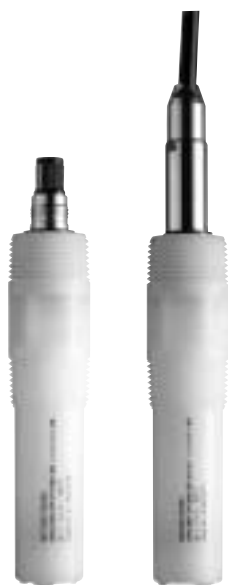
InPro 4501 VP InPro 4501 fixed cable