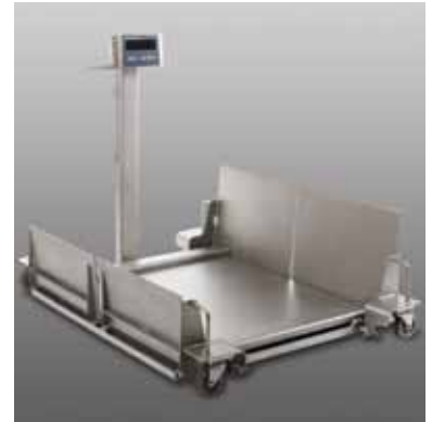
Stainless steel DECKMATE floor scale for sanitary applications.

Our load cells are approved for use in hazardous areas in most markets. DECKMATE load cells carry Factory Mutual, European Ex, and Canadian CSA Ex approvals when used with a METTLER TOLEDO intrinsically safe terminal.