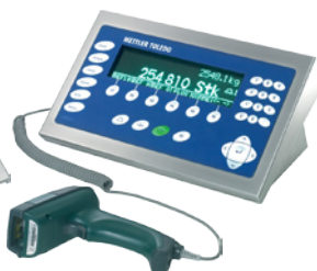
Bar code scanner