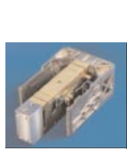
Viper Ex MB - MonoBloc inside Rugged aluminum alloy guarantees highly accurate measurement results for years. Better repeatability and linearity reduce fault and reject rates.