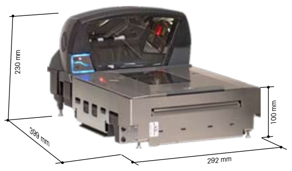
Stratos S Dimensions - 2200 Series

Subject to technical changes ©05/2008 Mettler-Toledo, Inc. RT1164.2EE