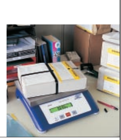
The Blue Viper SW is a broad product line offering exactly the right scale for weighing, dispensing or formulation duties in industry and commerce.

The scale can be adjusted to suit your needs perfectly. Ask your METTLER TOLEDO salesperson or specialist scale dealer for more