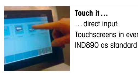
Touch it ... ... direct input: Touchscreens in every