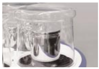
Individual draft shield for stable environmental conditions