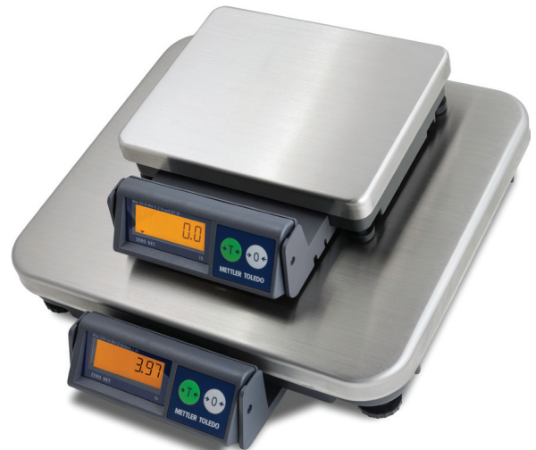
Ariva-S-Mini shown on top of Ariva-S

The Ariva-S-Mini standalone checkout scale is the METTLER TOLEDO checkout solution for retailers with the most stringent demands. The Ariva series for weighing at the register comprises weighing modules to be installed in bioptic scanners (Ariva-B), scales for integration of horizontal scanners (Ariva-H) and standalone scales without scanners (Ariva-S and Ariva-S-Mini).